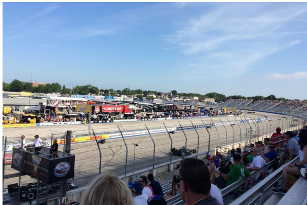
A gorgeous day at IndyFest!