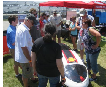
The SAE display drawing a crowd at IndyFest!