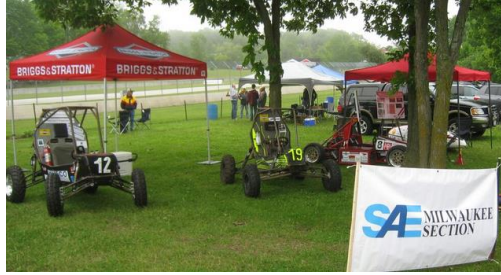
SAE Milwaukee collegiate vehicles at Road America