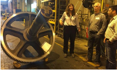
Touring the Falk facility in May