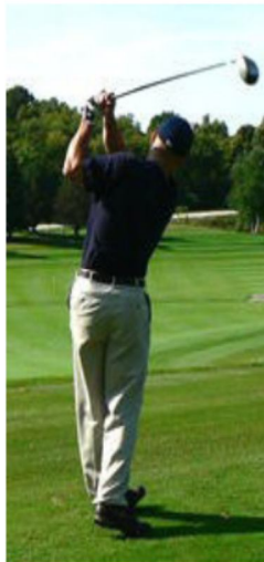
Mee-Kwon Park Golf Course 6333 West Bonniwell Road Mequon, WI 53097 (262) 242-1310